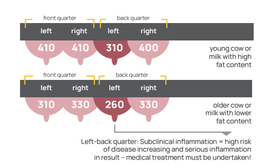
Examples of typical changes in the electrical resistance of milk