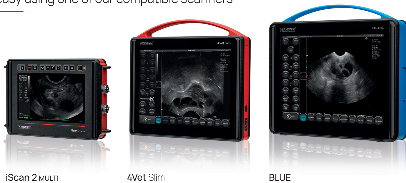
iScan 2 MULTI