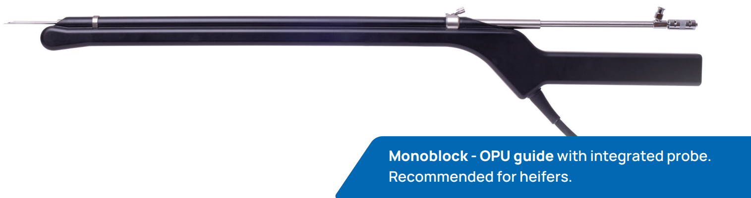
Monoblock - OPU guide with integrated probe. Recommended for heifers.

The guide is made from light and easy to clean plastic material. It is fast to assembly and disassembly. The ultrasound probe covers 136° degree field of view. The needle comes right above the surface of the lens to reduce the blind spot.