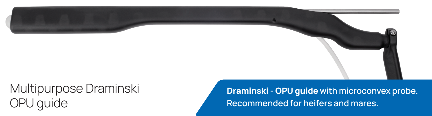
Draminski - OPU guide with microconvex probe. Recommended for heifers and mares.