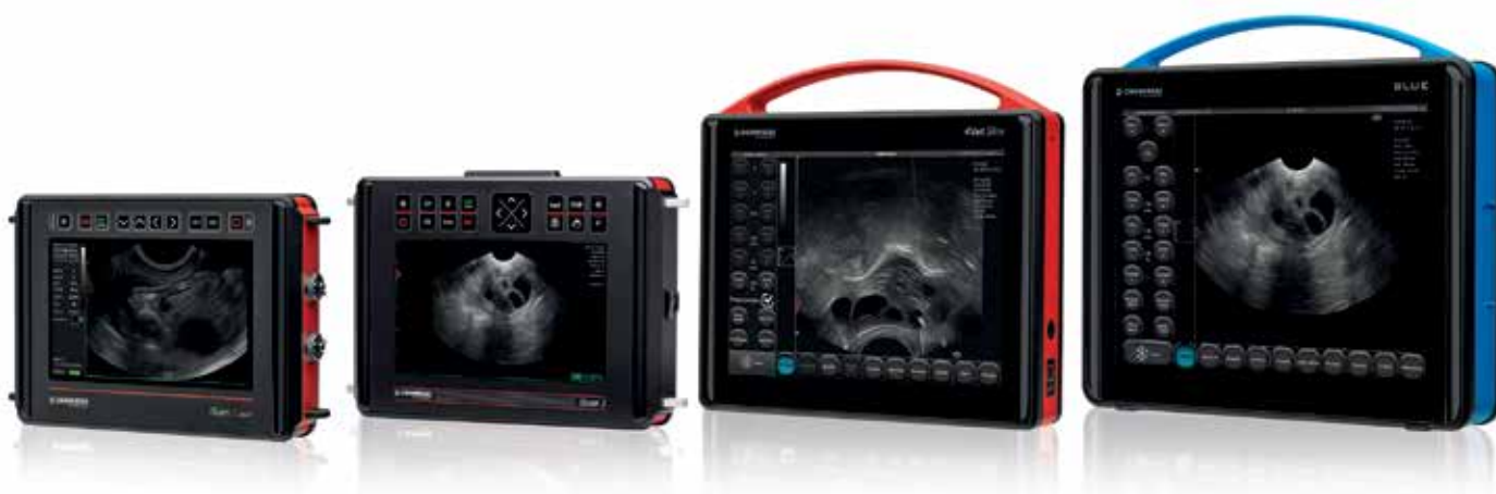
iScan 2 MULTI