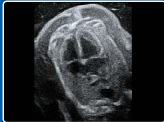
Cow foetus heart